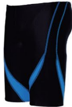
Long Swim Briefs