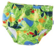
Plastic Pant or Rubber Diaper