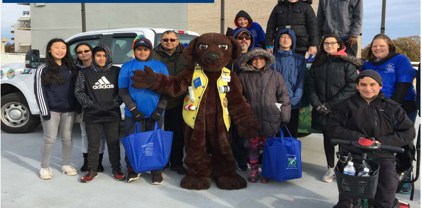
Recycling volunteers, along with Rocco the Recycling Retriever, encouraged residents to reduce, reuse and recycle for clean land, air and water during the 2017 Montgomery County Thanksgiving Parade in downtown Silver Spring.