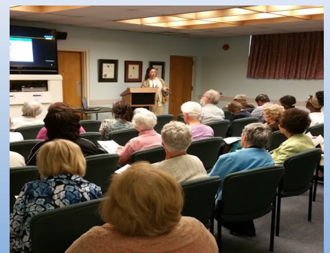
Free Online Learning Opportunities