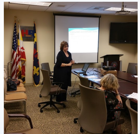
Understanding Separation and Divorce in MD