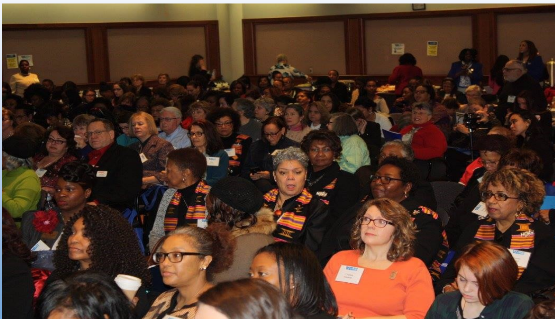
2016 Women's Legislative Briefing Attendees