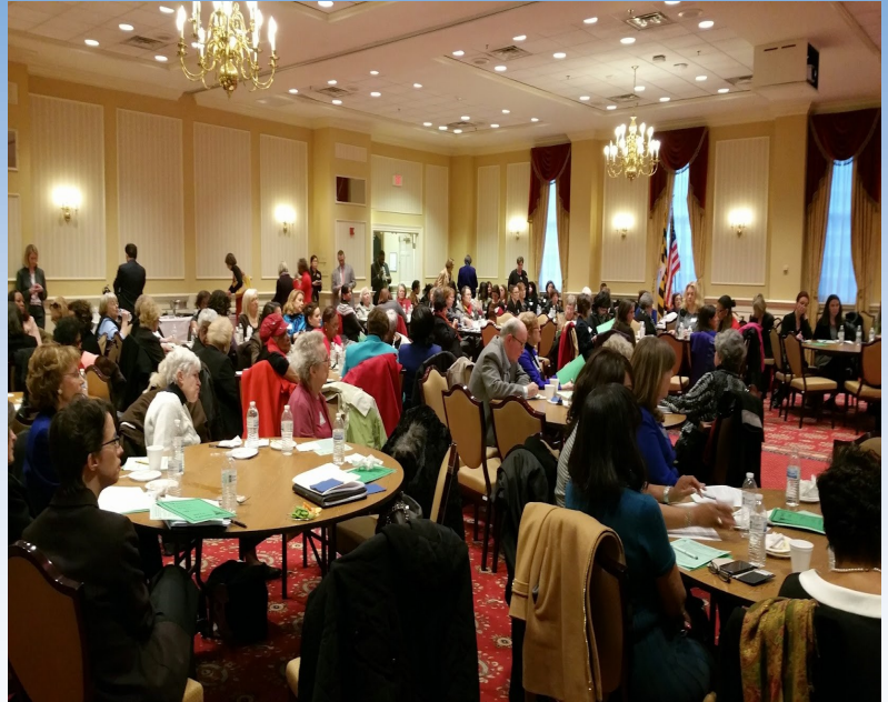
2016 Maryland Legislative Agenda for Women's 2016 Conference Annapolis