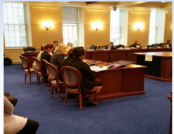
Commissioner Karmen Rouland testifying before the House Judiciary Committee in favor of SB 593/HB 646