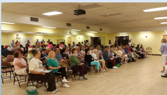
Easy Home Fixes with the Home Depot