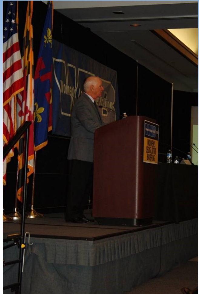
Greetings from Senator Ben Cardin