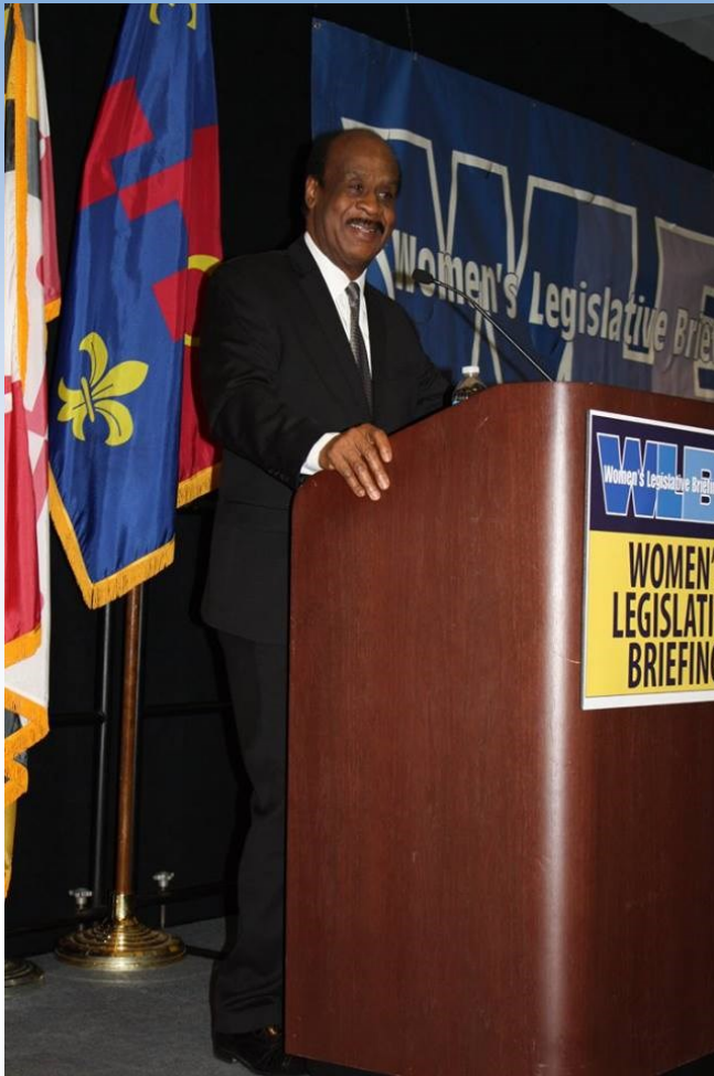
Greetings from County Executive Ike Leggett