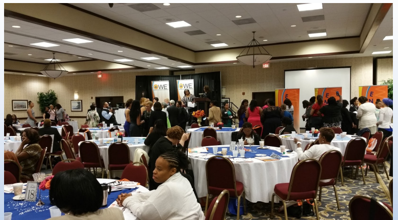
Prince George's County Commission for Women WE3 Conference