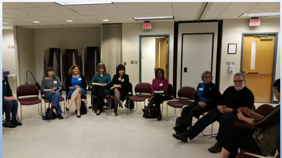
Participants of the Bethesda-Chevy Chase listening tour