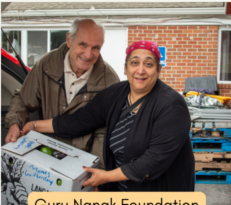
Guru Nanak Foundation

Ensuring students in Montgomery County have access to healthy food is a high priority for Manna Food Center and each week during this school year, Farm to Food Bank volunteers delivered 1,622 lbs of fresh produce and eggs to 4 elementary school-based pantries Manna operates , equivalent to 1,391 meals. Available items included apples, cauliflower, sweet potatoes, and sweet peppers.