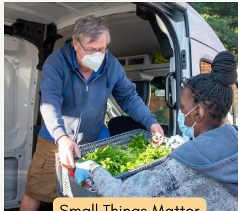
Small Things Matter