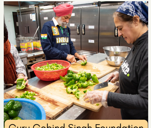
Guru Gobind Singh Foundation

Sharing local produce with the food assistance network in Montgomery County is an essential goal of the Farm to Food Bank program. Volunteer food runners deliver vegetables to Guru Nanak Foundation of America and Small Things Matter for their weekly distributions. At Guru Gobind Singh Foundation, volunteers create freshly prepared meals from farm-fresh ingredients and distribute those meals to partner food providers and directly to residents.