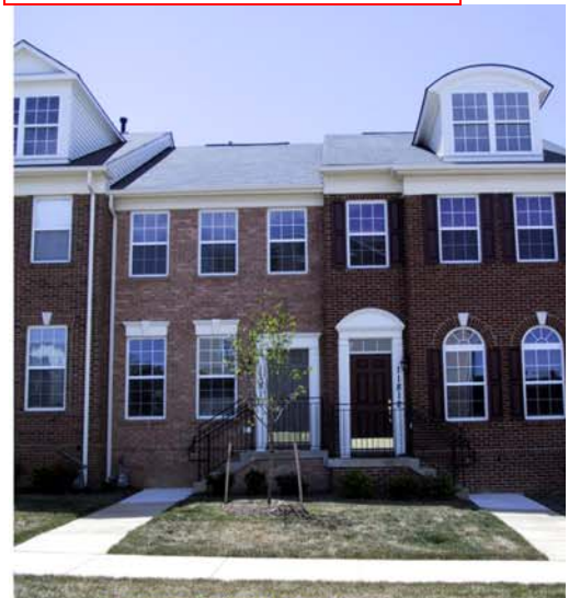
FEATURED EXTERIOR VIEW