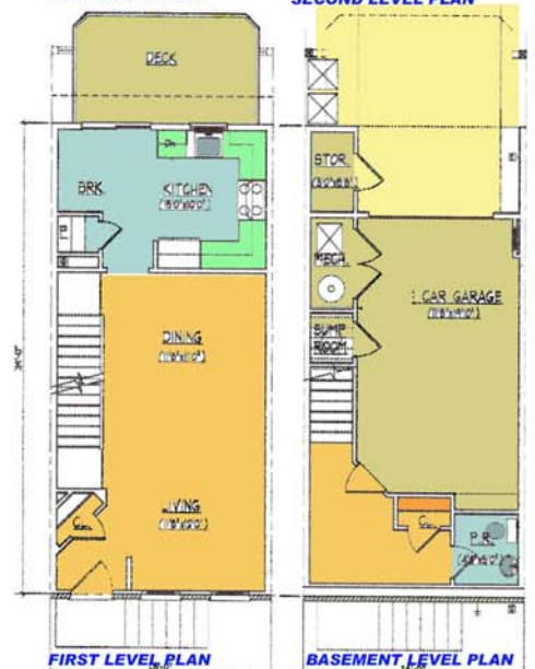
FIRST LEVEL PLAN