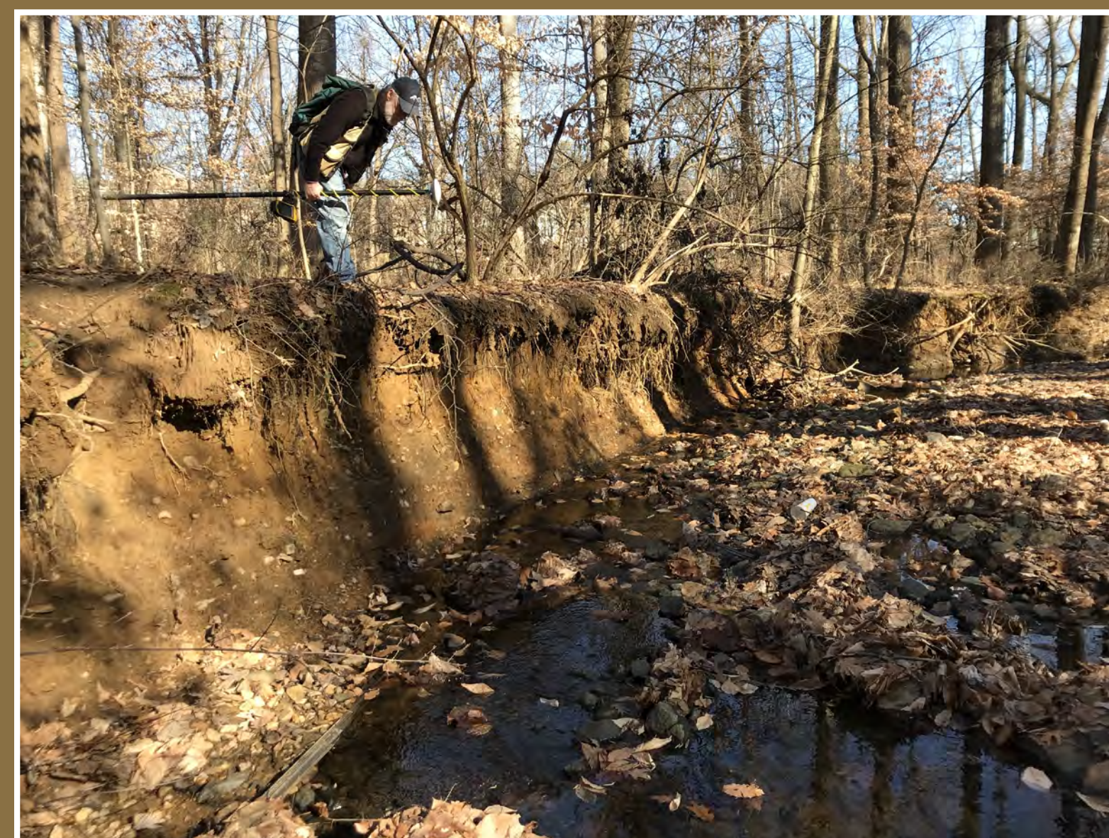
ROCK TOE (RT)