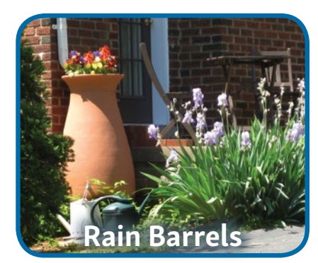
$1 per gallon (200 gallon minimum /100 for townhomes) $250 max. rebate per property