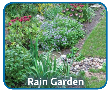
$10 per square foot (75 square foot minimum)