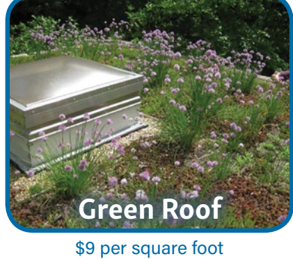
$9 per square foot (100 square foot minimum)