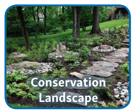
$5 - $6 per square foot (250 square foot minimum)

NOTE: Properties located in the City of Gaithersburg, City of Rockville, or City of Takoma Park are not eligible for the Montgomery County RainScapes Program. Contact those municipalities directly for information on their programs.