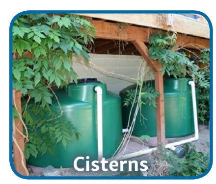
$1 per gallon (must hold 250-500 gallons) $500 max. rebate per property