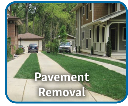
$3 – $7 per square foot (100 square foot minimum)