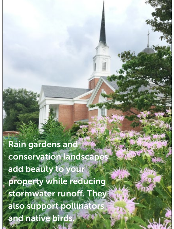
Silver Spring United Methodist

Last, consider how your congregants feel