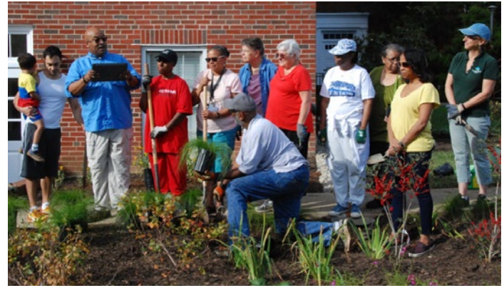
Colesville's minister and congregants at Planting Day

Results: These projects are a "faith in action" point of pride for the community. They reduce runoff to the nearby stream while attracting pollinators to the property. Families of the preschool walk by the project daily and learn about watershed health and what they can do at home.