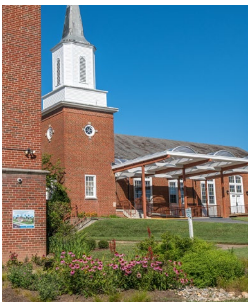
Colesville United Methodist's rain garden

Solution: The Montgomery County RainScapes program worked with the congregation to design a demonstration conservation landscape, a rain garden, and a community-based workshop. The parishioners