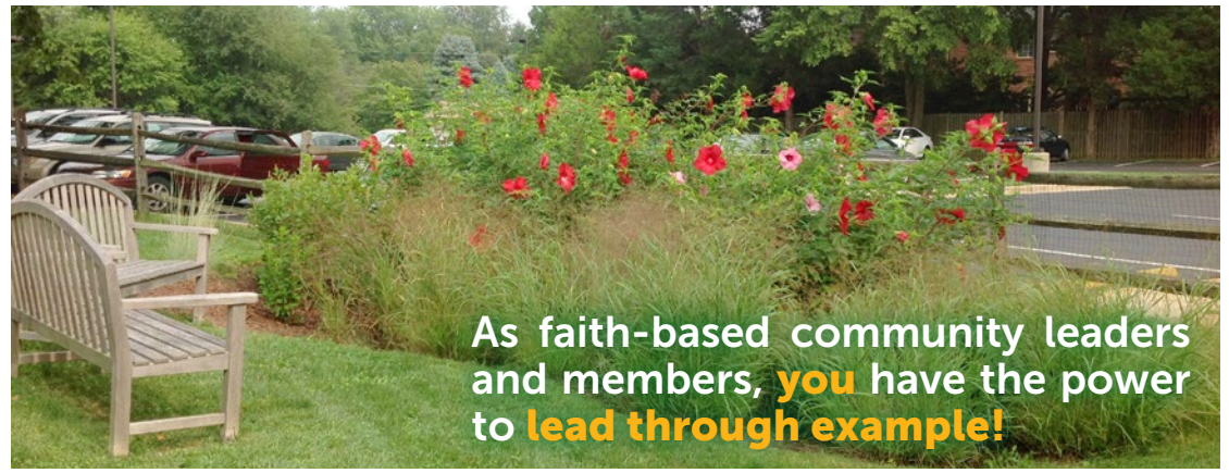
St. James' Episcopal Church rain garden helps solve winter flooding problems in the parking lot.

*Estimated using data from Montgomery County's Department of Environmental Protection