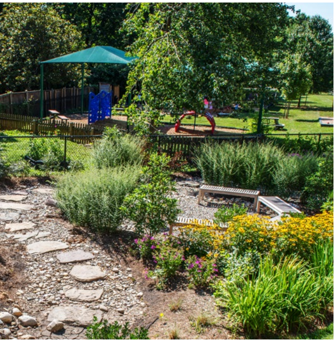
A walking path & outdoor meeting space are incorporated into Beth Sholom's conservation landscape,

Solution: One synagogue member was a landscape designer who had worked with