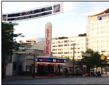
AFI Theatre Restoration

A few examples of Gudelsky Family's "Quiet Philanthropy" serving Downtown Silver Spring: