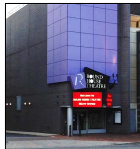
Round House Theatre