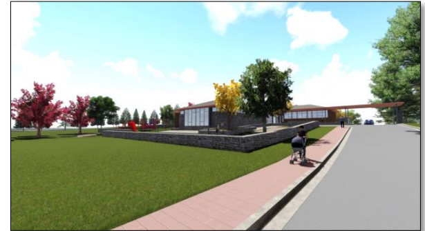
MBGDC proposal preserves and renovates existing library building