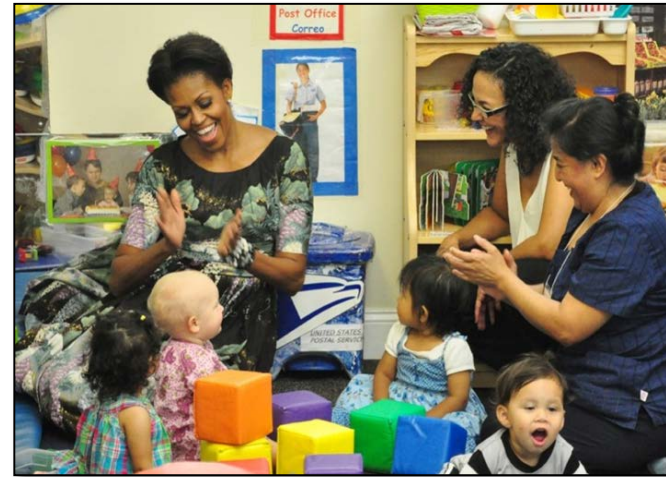
Former First Lady, Michelle Obama, at CentroNia in 2012