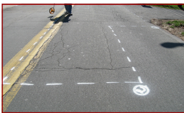
Typical paint markings

ings that outline areas for pavement replacement, such as those shown in the picture below. The markings enable us to estimate the quantity of asphalt needed for full depth patching and provide the locations of the distressed pavement. Crews will excavate the distressed pavement with a pavement milling machine or Gradall excavator.