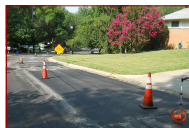
New patch is flush with existing pavement