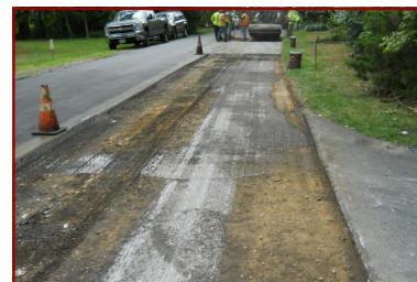
Pavement will be replaced in 2 phases