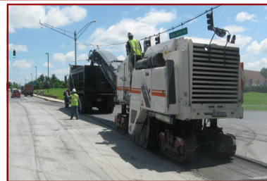
Milling machine excavating

Thank you for your cooperation as we work to improve the county infrastructure for residents and users!