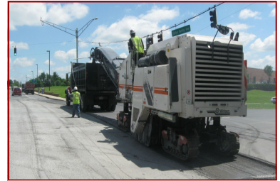
Milling machine excavating

Thank you for your cooperation as we work to improve the county infrastructure for residents and users!