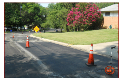
New patch is flush with existing pavement