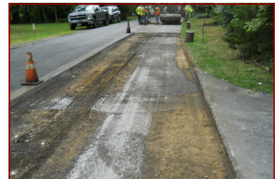
Pavement will be replaced in 2 phases