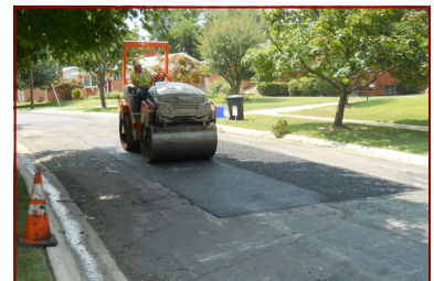
New asphalt is placed and compacted