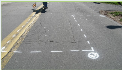
Typical survey paint markings

The last survey was completed in 2017. At that time, MCDOT concluded a complete condition inventory of all County roads, identifying and rating the condition of each. This new assessment survey, updated every two years, has enabled the development of County-wide roadway repair strategies based on a formula-based objective rating system