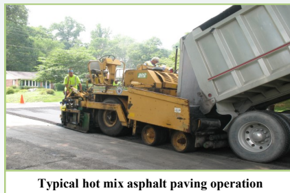
Typical hot mix asphalt paving operation