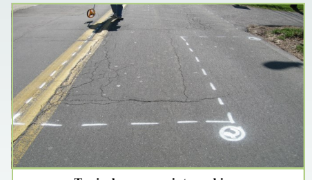
Typical survey paint markings

The Montgomery County Department of Transportation's (MCDOT) Division of Highway Services (DHS) maintains nearly 5,200 lane miles of streets and highways in the county's transportation system. As part of our pavement system preservation efforts, MCDOT initiated a new Pavement Management System in 2008. At that time, MCDOT concluded a complete condition inventory of all County roads, identifying and rating the condition of each. This new assessment survey, updated every two years, has enabled the development of County-wide roadway repair strategies based on a formula-based objective rating system coupled with budgetary parameters.