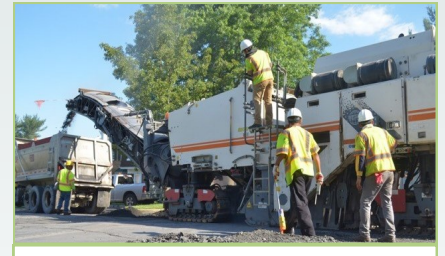
Typical milling operation

3. Full Depth Patching – Full depth patching restores the pavement's structural integrity and capacity to support vehicle loads. The areas of distressed pavement marked by the MCDOT inspectors is removed and replaced by new asphalt pavement. The final paving of the road will cover these patched areas.