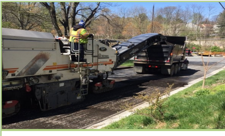
Milling machine patch excavating

ment. Crews will excavate the distressed pavement with a pavement milling machine