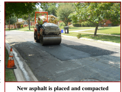
New asphalt is placed and compacted