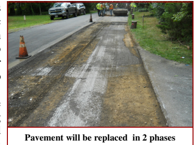
Pavement will be replaced in 2 phases