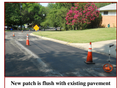
New patch is flush with existing pavement