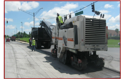
Typical milling excavation operation

Thank you for your cooperation as we work to improve the county infrastructure for residents and users!