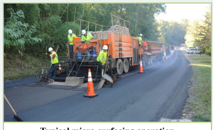
Typical micro-surfacing operation

We apologize in advance for any unavoidable inconvenience and thank you for your cooperation and patience as we work to improve the County infrastructure for residents and users.