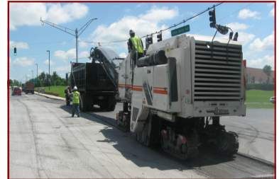
Milling machine excavating

Thank you for your cooperation as we work to improve the county infrastructure for residents and users!