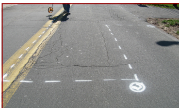
Typical paint markings

You may have noticed paint markings that outline areas for pavement replacement. The markings enable us to estimate the quantity of asphalt needed for full depth patching and provide the locations of the distressed pavement. Crews will excavate the distressed pavement with a pavement milling machine or Gradall excavator.