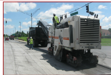
Milling machine excavating

Thank you for your cooperation as we make these improvements to the County infrastructure!