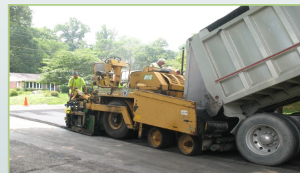
Typical hot mix asphalt paving operation

will be remarked shortly after all paving operations have been completed.