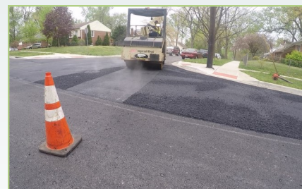
New asphalt is compacted with steel wheeled roller

Quality control for the entire project will be managed by County inspection staff to ensure that the project meets County specifications.