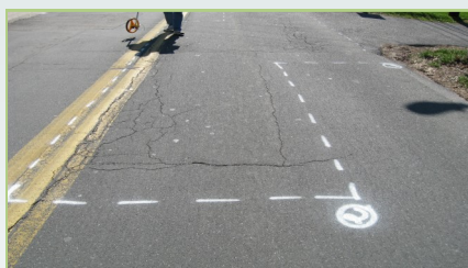
Typical survey paint markings

Overall, the pavement conditions on Bethesda Avenue were generally rated as fair, with some areas described as needing more attention. This rating meets the criteria for the County's Residential Roadway Resurfacing Program, consisting of full-depth (base repair) patching followed by hot mix asphalt (HMA) overlay.