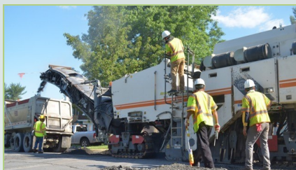
Typical milling operation