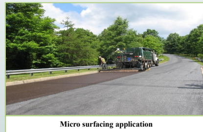
Micro surfacing application

where they existed prior to the resurfacing project.