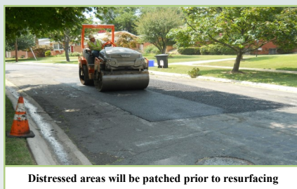
Distressed areas will be patched prior to resurfacing

3. Crack Sealing - An additional step may be necessary to seal large cracks that may not require full depth patching. A flexible filler material is injected into the cracks and sealed with a special tool.