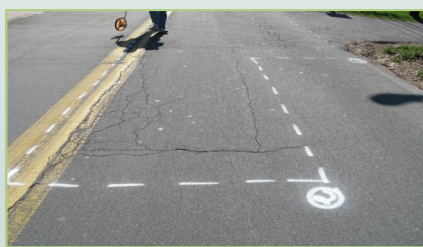
Typical survey paint markings

pavement evaluation has determined that, prior to resurfacing, full depth asphalt patching of the pavement or other repairs may be necessary at selected locations. Full depth patching restores the pavement's structural integrity and capacity to support vehicle loads.