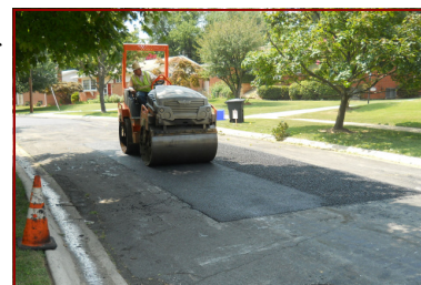
New asphalt is placed and compacted