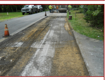
Pavement will be replaced in 2 phases