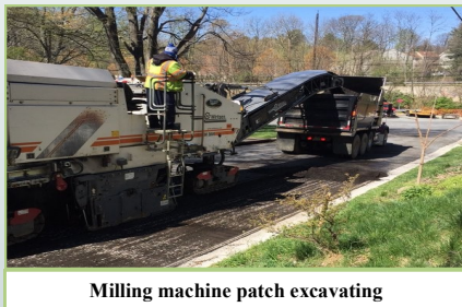
Milling machine patch excavating

ment. Crews will excavate the distressed pavement with a pavement milling machine