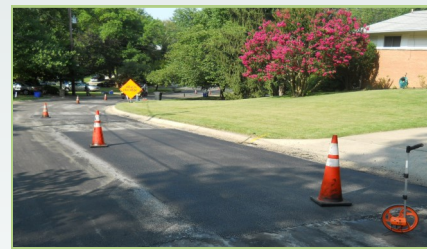
New patch is flush with existing pavement

Access to residences will be available at all times; however, minor delays may be experienced as workers restrict traffic from freshly