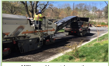
Milling machine patch excavating

Areas of pavement distress are excavated and replaced with hot mix asphalt. This method is used in isolated areas where pavement failures extend through the road base. Full-depth patching restores the pavement's structural integrity and capacity to support vehicle loads. Further, patching will prevent water from infiltrating through the pavement and into the underlying road base, which exacerbates the degree and extent of pavement deterioration. Failing pavement conditions are dynamic in nature and will worsen, nearly exponentially, under conditions such as harsh winters and wet summers. Patching with HMA will yield a service life of between 15-20 years.