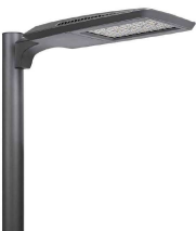
PARKING LOT LIGHT NOT TO SCALE OR APPROVED EQUAL

MANUFACTURER: GARDCO WEBSITE: LIGHTINGPRODUCTS.SIGNIFY.COM MODEL NO. PUREFORM LED BOLLARD PBL MATERIAL/ FINISH: BRONZE FINISH SHAFT HEIGHT: 42" QUANTITY: 56