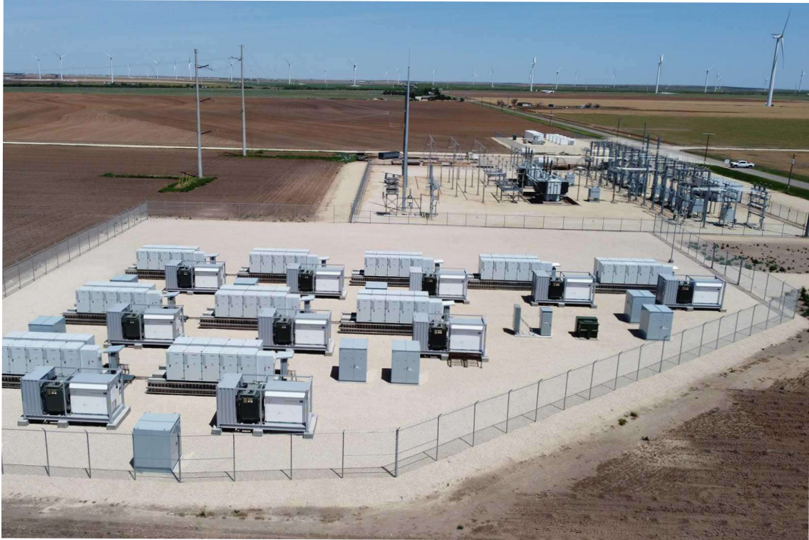
Exhibit # 5