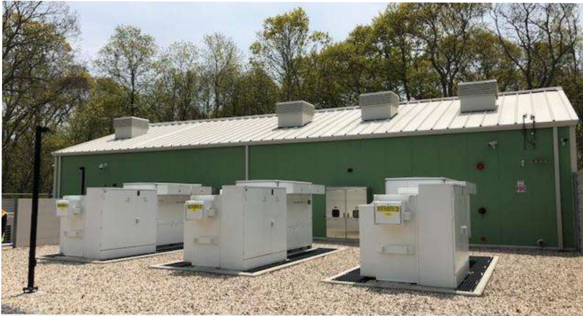
Exhibit 10 OZAH Case No: CU 24-13