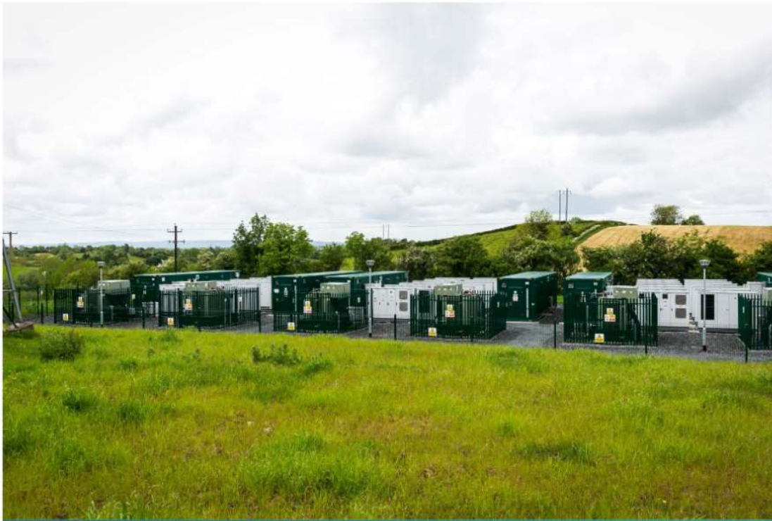
Exhibit # 5