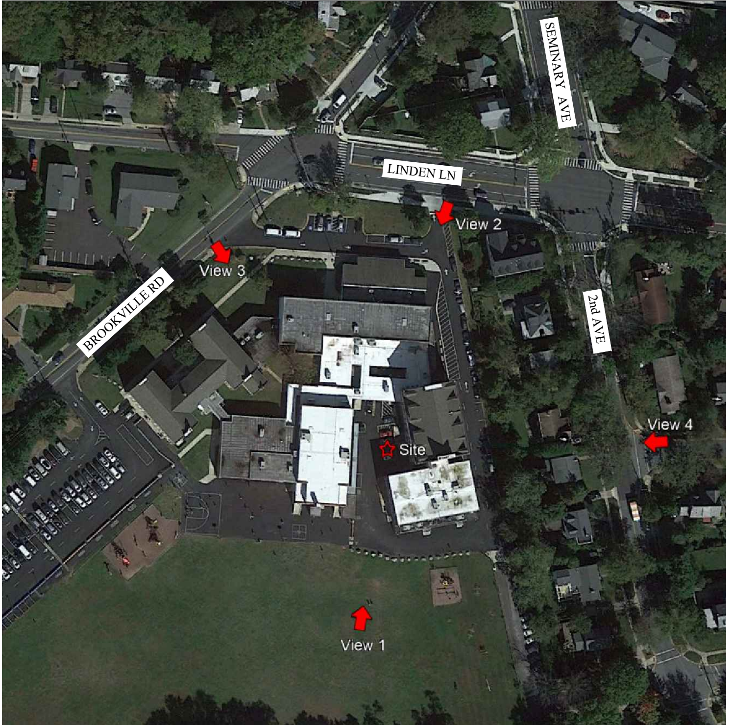
Exhibit 27 OZAH Case No: CU 24-14