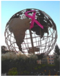
1st place winner -Best Community Photo ©2018