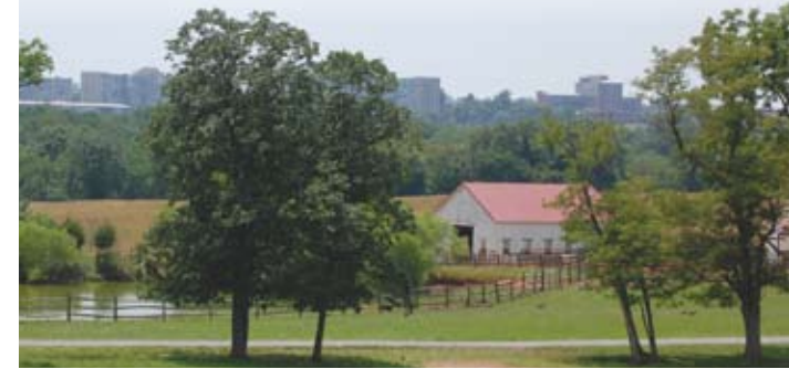
Poplar Spring Animal Sanctuary is a 427-acre farm near Poolesville that was permanently preserved under easement in 2008. It is situated along the Potomac River overlooking Loudon County, Virginia.

An agricultural land preservation easement is a voluntary agreement between a property owner and an agency or organization that places permanent restrictions on the land. The easement is recorded in the land records and becomes a permanent encumbrance on the property. Some easements are purchased from the landowner by an agency or organization, and some are donated by the landowner. The restrictions that are placed on the land are generally for the purpose of forever protecting the farmland for future food and fiber production. Most commonly, these restrictions limit or prevent future residential, commercial, and/or industrial development on the property. In addition to these restrictions, easements often require environmental stewardship, forest management planning, and/or other plans designed to protect the land.