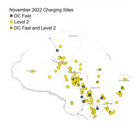
Figure 1: Maps from the DEP's new Charge Montgomery Story Map which show the total number of plug-in registrations per tract as well as charging sites in the County.