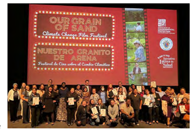
Figure 3: Climate Stories Ambassadors at the Climate Change Film Festival.