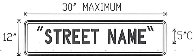
BLACK LEGEND ON WHITE BACKGROUND

ROAD CLOSED AND EFFECTIVE SIGNS SHALL BE PLACED TWO (2) WEEKS PRIOR TO THE ROAD CLOSURE. THE EFFECTIVE SIGN SHALL BE REMOVED AND REPLACED WITH THE REOPENS SIGN TWO DAYS AFTER THE ACTUAL DATE OF THE ROAD CLOSURE.