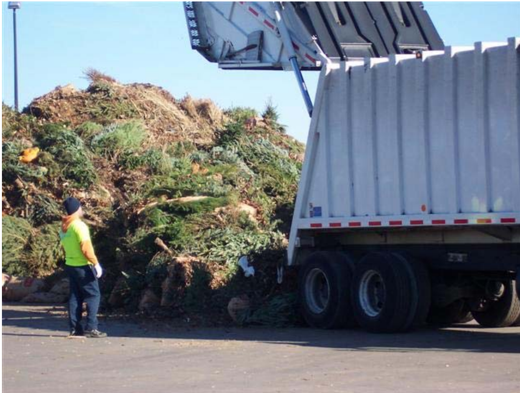
Seasonal Yard Trim Collection in progress.