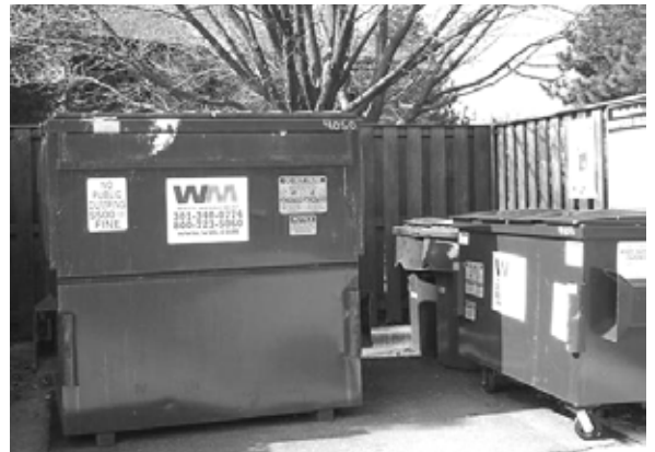
Collection Area with 2-Cubic Yard Mixed Paper and Cardboard Recycling Dumpster

Want a second opinion? Here are statements from managers at properties that switched to 2-cubic yard mixed paper and cardboard recycling dumpsters.