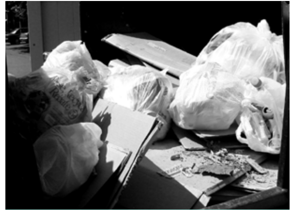
Cardboard Mixed With Trash

Call us at (240) 777-6400! We are happy to help you improve your recycling program with site-specific recommendations and staff and resident education.