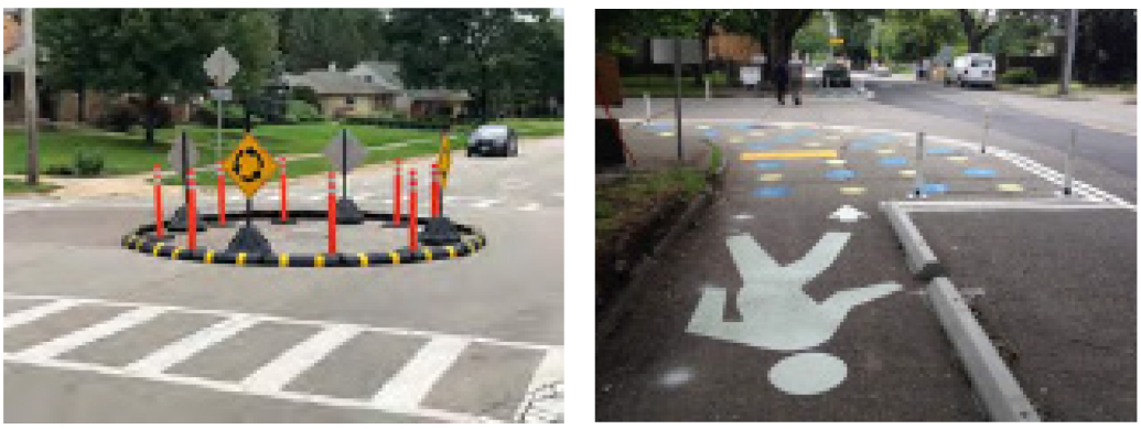
Row 2, left image: mini roundabout. Right image: walking lane.

Row 1, left image: Speed hump. Right image: bump-out.