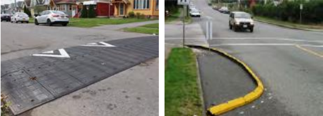
Row 1, left image: Speed hump. Right image: bump-out.

A "Neighborhood Greenway" is a street where the safe movement of pedestrians and cyclists is prioritized and the fast, through movement of vehicles is discouraged. Tools can include speed treatments, like speed humps and chicanes, and volume management, like diverters.