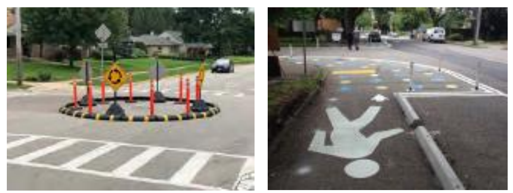
Row 2, left image: mini roundabout. Right image: walking lane.

(End of What is a Neighborhood Greenway sidebar).