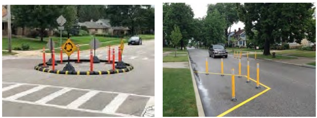
Row 2, left image: mini roundabout. Right image: chicane.

(End of What is a Neighborhood Greenway section).