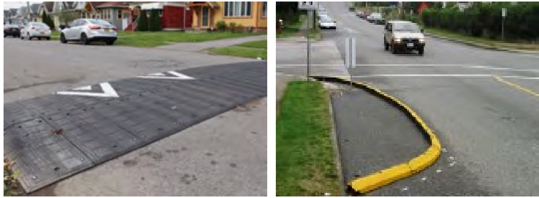
Row 1, left image: Speed hump. Right image: bump-out.

A "Neighborhood Greenway" is a street where the safe movement of pedestrians and cyclists is prioritized and the fast, through movement of vehicles is discouraged. Tools can include speed treatments, like speed humps and chicanes, and volume management, like diverters.