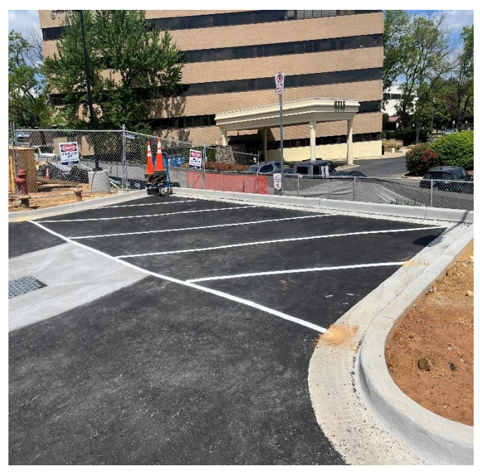
Turn around area to back into stalls.

ER Entrance parking stalls (YELLOW LINES).