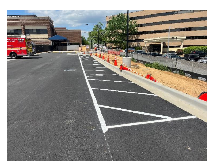
NO Parking Area. Area for EMS units to back-up