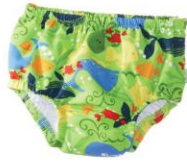
Plastic Pant or Rubber Diaper