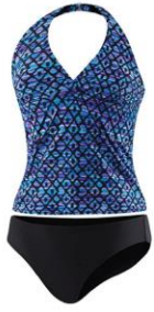
2 piece Tankini