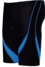
Long Swim Briefs