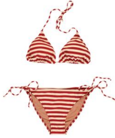
2 piece Bathing Suit