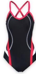
1 piece Bathing Suit