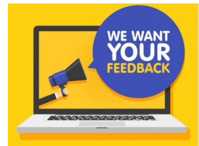
(Graphic: MCPS website)

For many families with school-age children and the educators on whom they rely, a collective catch-our-breath reflex is likely reverberating nationally; and may be imminent for New York City students with their grade-level-specific phased opening for in-person schooling starting Sept. 21 . Relatedly, the Centers for Disease Control issued Indicators for Dynamic School Decision-Making (Sept. 15), and considerations for Mitigation Strategies in K-12 Schools (Sept. 18). COVID-19 Return to Sports guidance was released by the American Academy of Pediatrics (Sept. 18). The next page features a chart with updates from MCPS, which is currently seeking parents’ feedback on the new academic year; and from adjacent school districts.