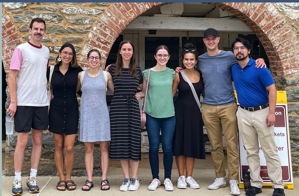
2022 Summer Fellows