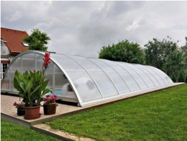
Example Pool Enclosure in Closed Position