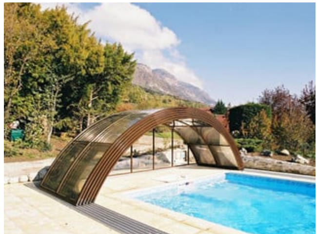
Example Pool Enclosure in Closed Position

This ZTA would increase the permitted square footage for an accessory structure on residential property to allow the installation of an above-ground pool enclosure for year-round swimming. This can be a valuable aging-in-place strategy, and can be very helpful for individuals who use swimming as a form of therapy or as their main form of physical exercise.