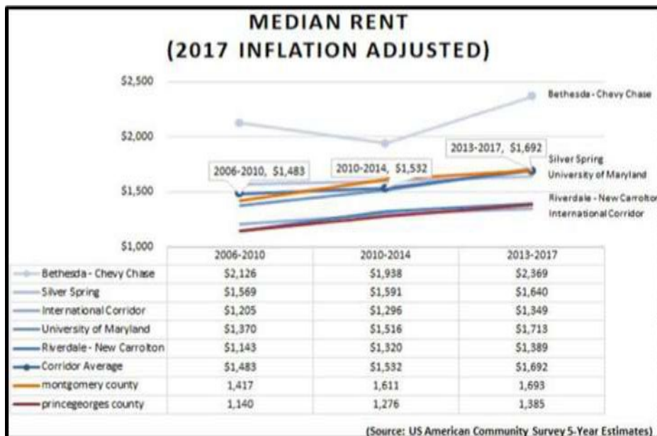
Figure 2: Purple Line Demographics (Alternative)