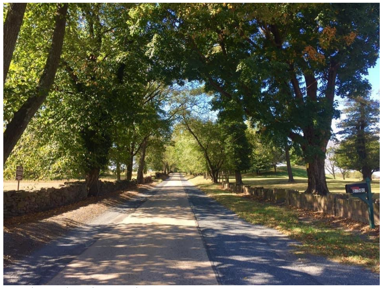
Martinsburg Road... a politicians road