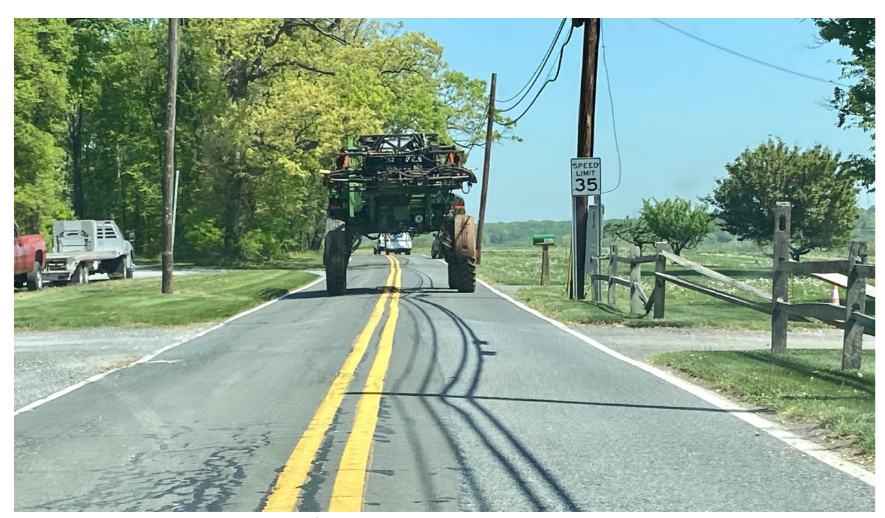
Large, slow moving equipment with flag truck in lead