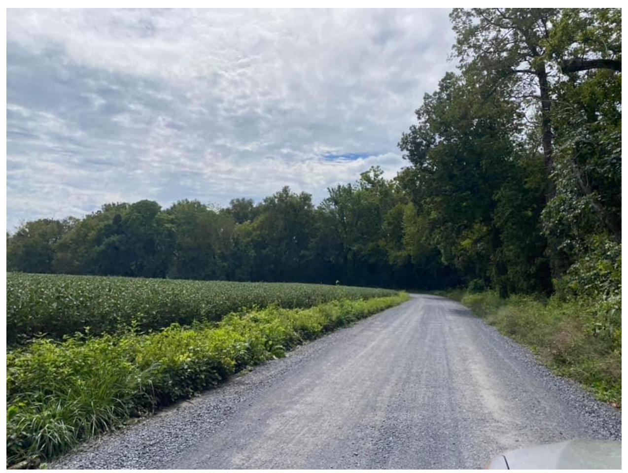
Gravel can be, as here, well maintained and safely traveled