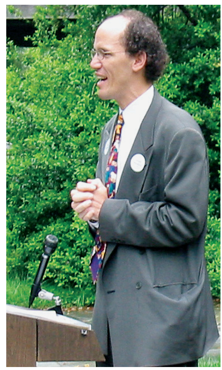
Fall 2003 Issue No. 1