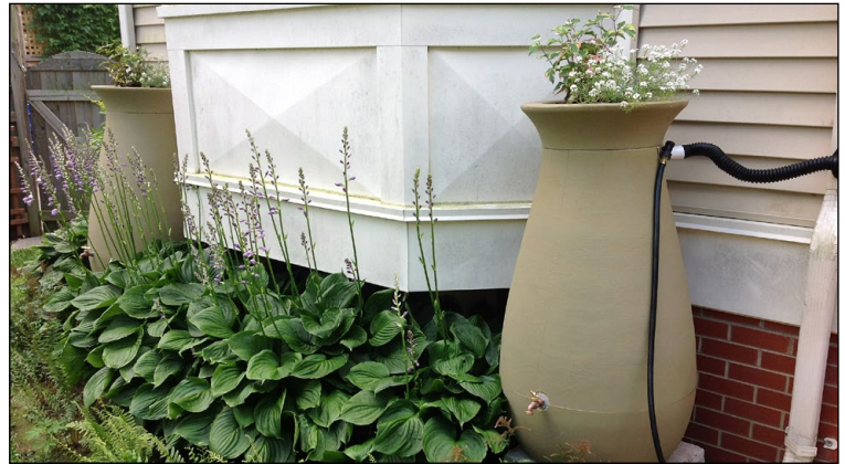
Rain barrels with "planter tops"