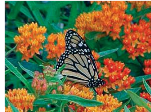
D – Aesclepias tuberosa