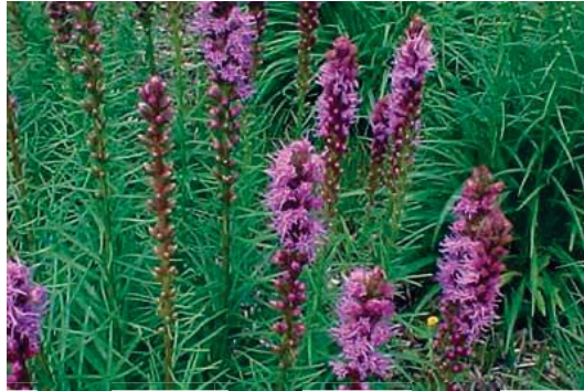
B – Liatrus spicata