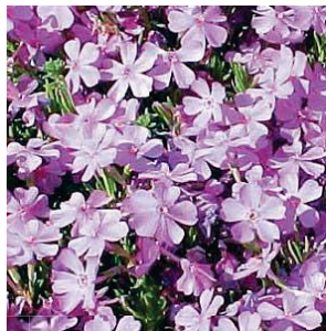
B – Phlox subulata (alternate for front edge)