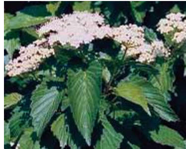
A – Viburnum dentatum