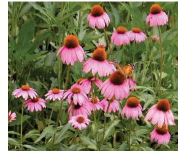
C- Echinacea 'Kim's Knee-Hi'