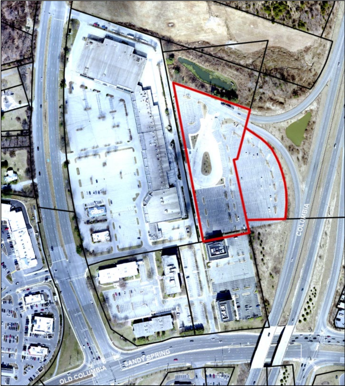
FIGURE 2: AERIAL OF SITE

The Site contains two adjacent parcels that are improved with the Burtonsville Park and Ride Lot. Parcel One is 4.03 and Parcel Two is 2.03 acres, for a total of approximately 6.06 acres. The Park and Ride Lot includes a bus loop and approximately 475 parking spaces. The Site is accessible from National Drive and Sandy Spring Road, and the southbound lanes of US 29.