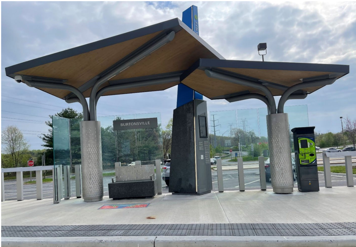
FIGURE 4: BURTONSVILLE FLASH BUS STATION