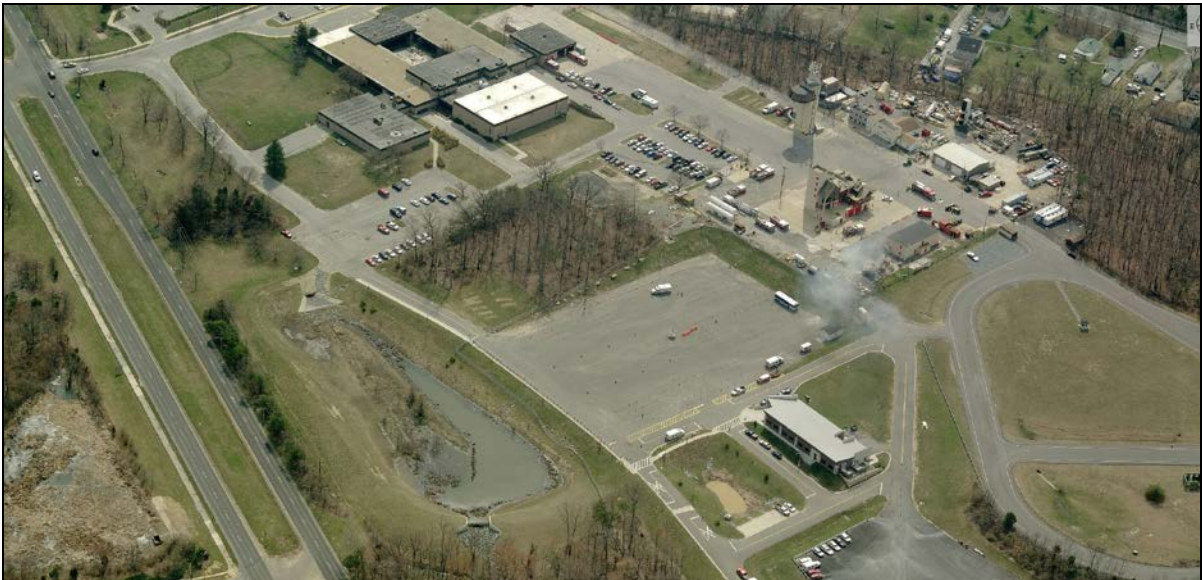
FIGURE 1: AERIAL OF SITE LOOKING SOUTH – PRIOR TO BUILDING DEMOLITION

The road on the left side of the image is Great Seneca Highway.