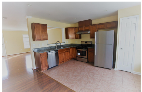
Bright & updated kitchen